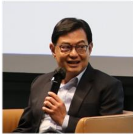
Heng Swee Keat

Former Deputy Prime Minister of Singapore